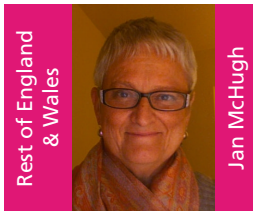
Rest of England & Wales