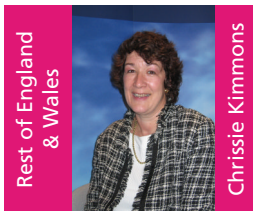
Rest of England & Wales