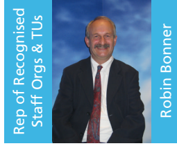
Rep of Recognised Staff Orgs & TUs