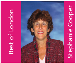
Rest of London