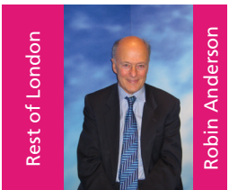
Rest of London