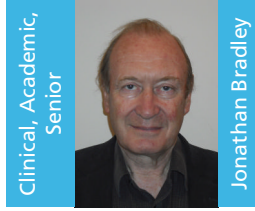
Clinical, Academic, Senior