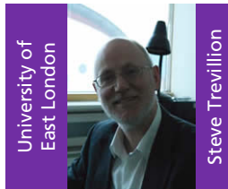
University of East London