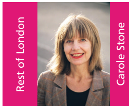
Rest of London