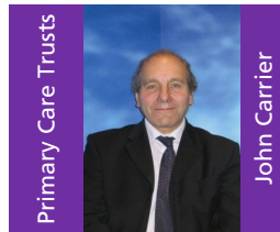
Primary Care Trusts