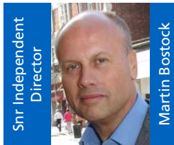
Snr Independent Director