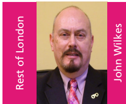
Rest of London