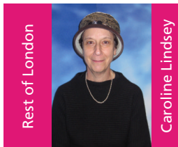
Rest of London