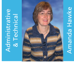
Administrative & Technical