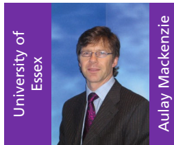
University of Essex