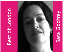
Rest of London